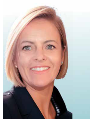
HEAD OF PASTORAL SAFEGUARDING LEAD