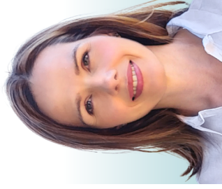
Heads of Pastoral