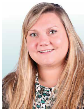
HEAD OF SECONDARY