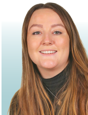
HEAD OF PRIMARY & EYFS