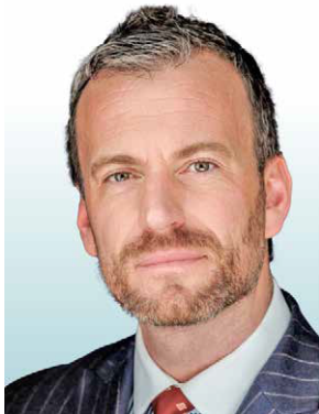
EXECUTIVE PRINCIPAL DEPUTY SAFEGUARDING LEAD