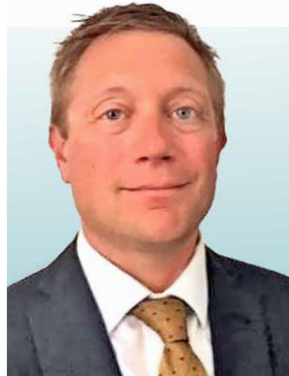
DEPUTY EXECUTIVE PRINCIPAL