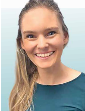
HEAD OF SIXTH FORM