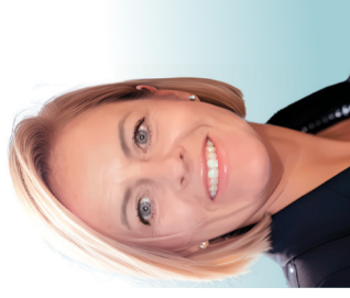
Heads of Pastoral