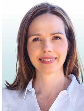
HEAD OF PASTORAL SAFEGUARDING LEAD