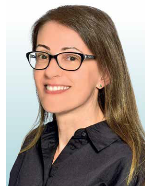
HEAD OF ADMISSIONS